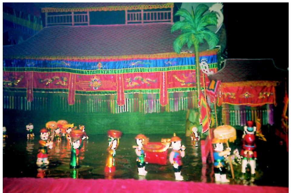
Hanoi's famous water puppet theatre.

I must not end without paying tribute to the hardy determination of the hundreds of Vietnamese women and children who ply the dusty congested streets of Hanoi each day to eke out a living. This represents one stark reality among a host of other grim scenarios in Asian countries that we, the privileged women participants inside the cool and comfortable Hanoi Horizon Hotel, were confronted with and had worked hard to find solutions for, in our deliberations.