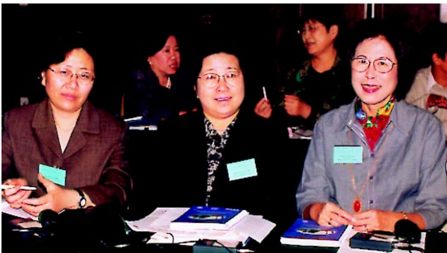
With delegates from China (center) and Japan.