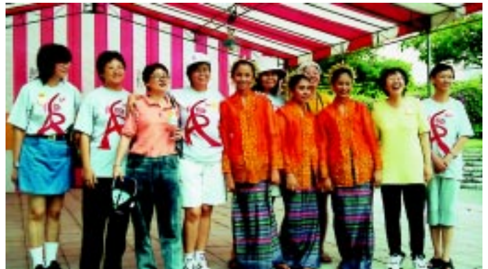
UWAS members and Malay Dancers