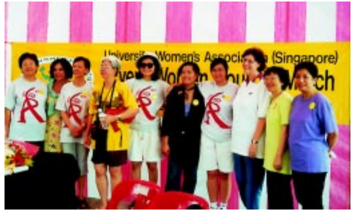
Organising Committee and guests