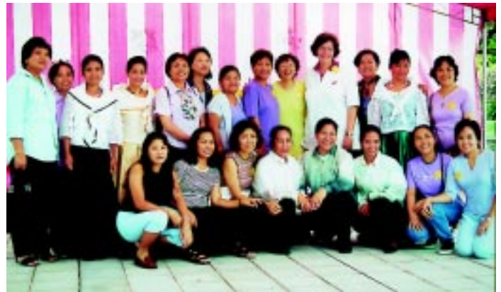
Phillipino Overseas workers (FOWS) Dance Troop