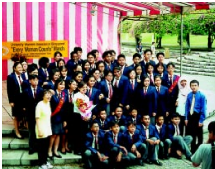
It's Time to Celebrate!