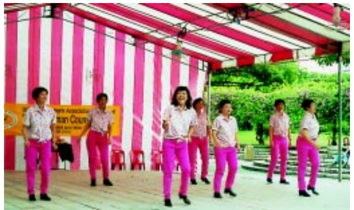
Shall we Dance?