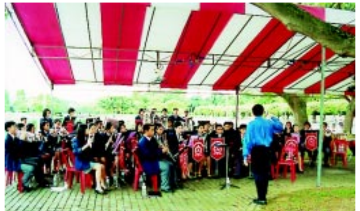
Bukit Batok Secondary School Band to grace the occasion