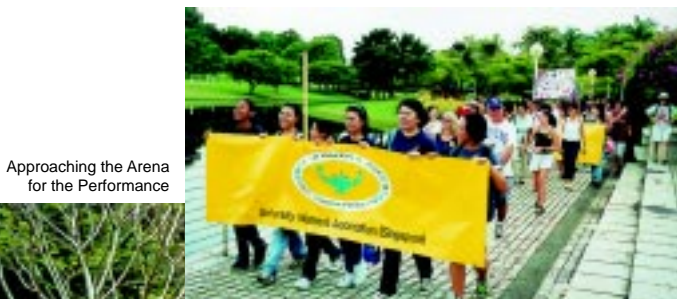
Approaching the Arena for the Performance