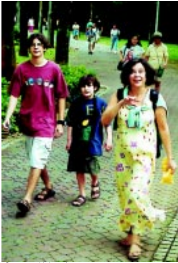
Come and join us!