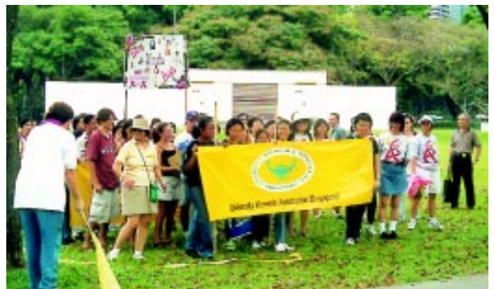
Flag off at the Marina Bay MRT