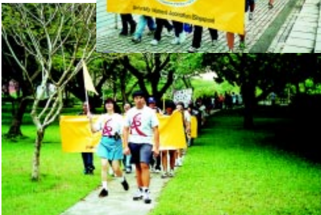
The march of Marina City Park