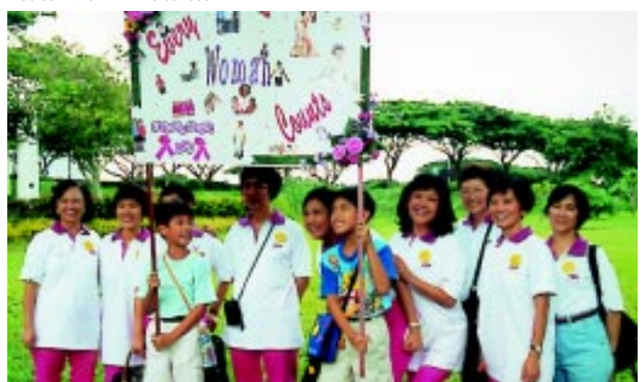
and the winner for the Poster Competition is...