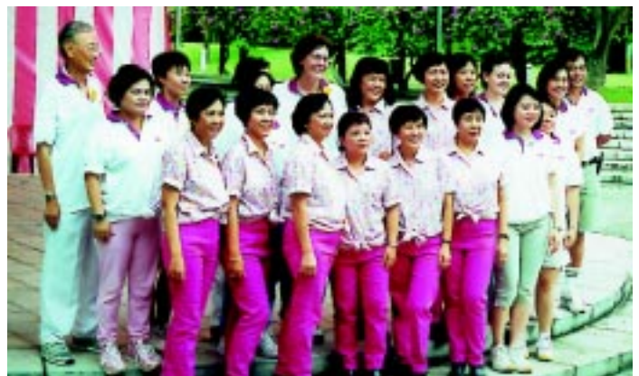
"Ladies in the Pink" line dances