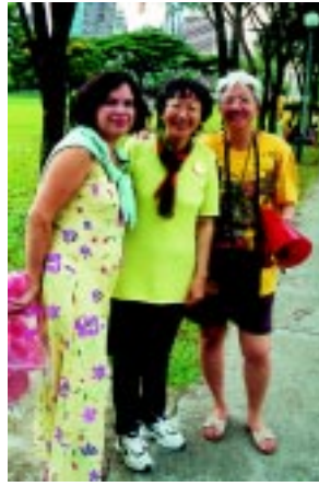
Ready to receive our Guest of Honour - Every Woman Counts